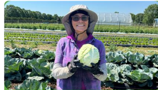
Lourdes Farm Coordinator